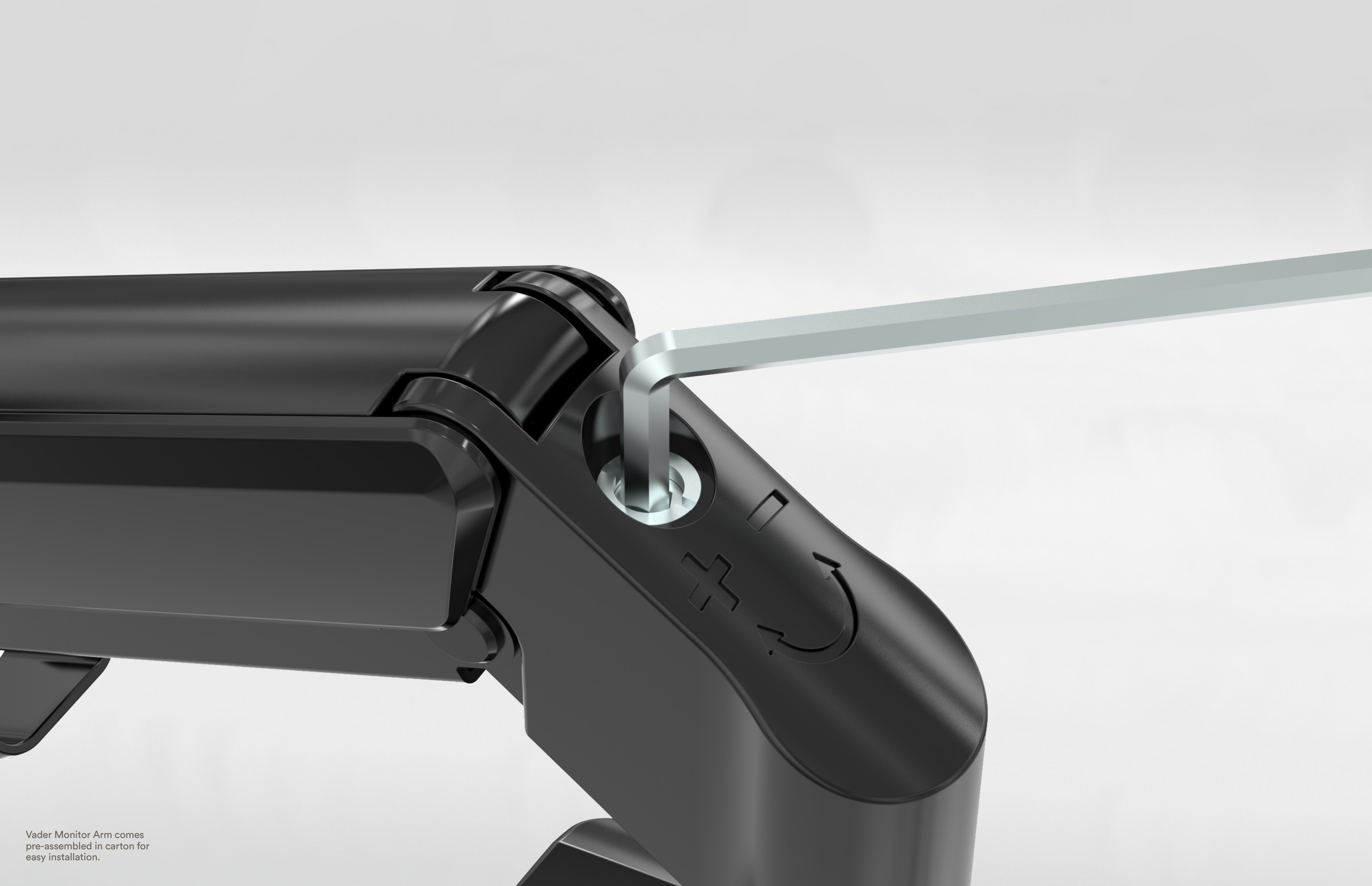
Vader Monitor Arm comes pre-assembled in carton for easy installation.